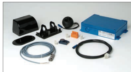
Complete with all mounting hardware necessary for either surface-mount or flush-mount installation on cab transom